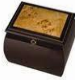
Mahogany Burl Chest