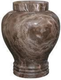
Marble Tiger Eye