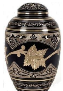
Brass Patina Leaf